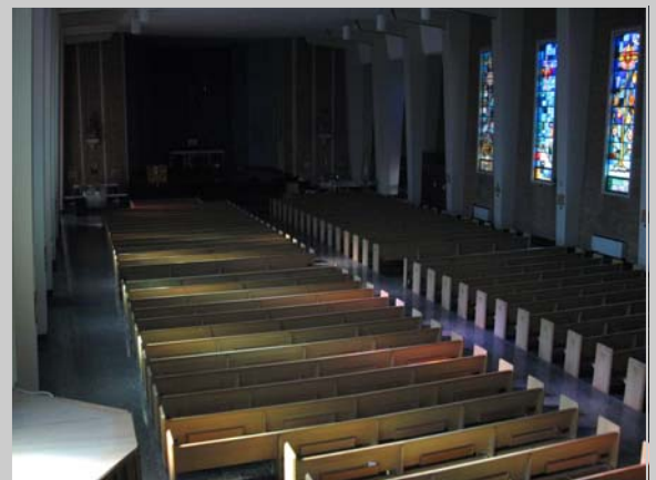
Interior of Church