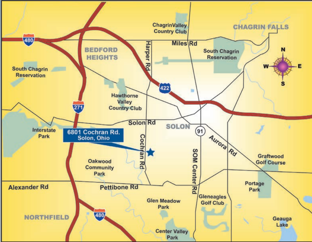
ZOOMED-OUT AREA MAP